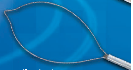
iSnare® system - oval snare