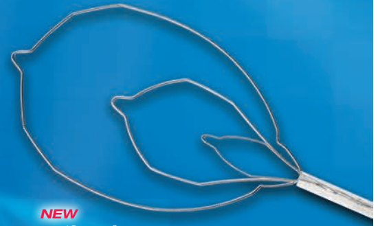
NEW iSnare® system - Lariat® snare