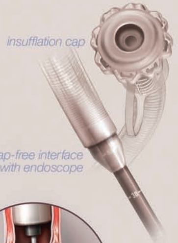
insufflation cap gap-free interface with endoscope

The Guardus® overtube safeguards mucosa and helps protect the airway during foreign body extraction and other procedures requiring multiple scope insertions.