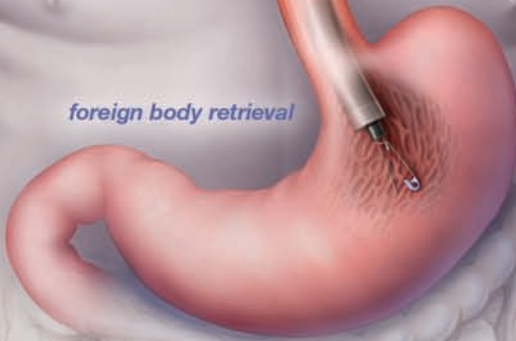
foreign body retrieval