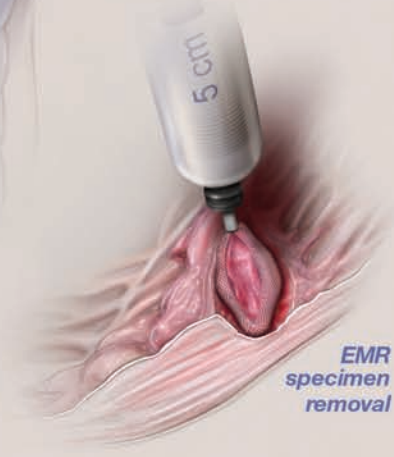
EMR specimen removal