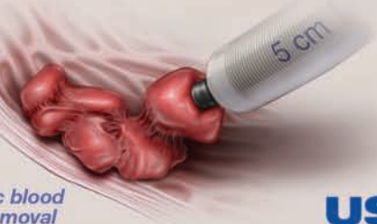
gastric blood clot removal