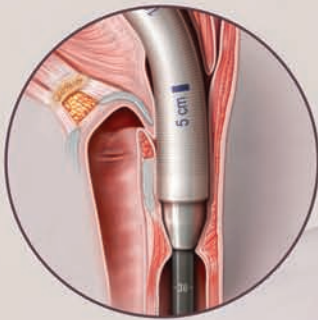
smooth esophageal intubation