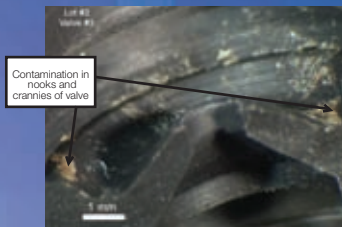
Fig 1.3 - Internal cross section of valve observed at magnification of approximately 10x demonstrates presence of contamination in nooks and crannies of valve.