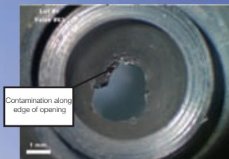
Fig 1.2 - Valve observed during microscopy demonstrates wear and damage after use, manual cleaning and high-level disinfecting. Note the presence of contamination along edge of the opening.

(Figure 1.2-1.4 taken from David M. Parente, BS, BA, MBA, "Could Biopsy Port Valves be a Source for Potential Flexible Endoscope Contamination," Infection Control Today , Volume 11, No. 6, (June 2007).